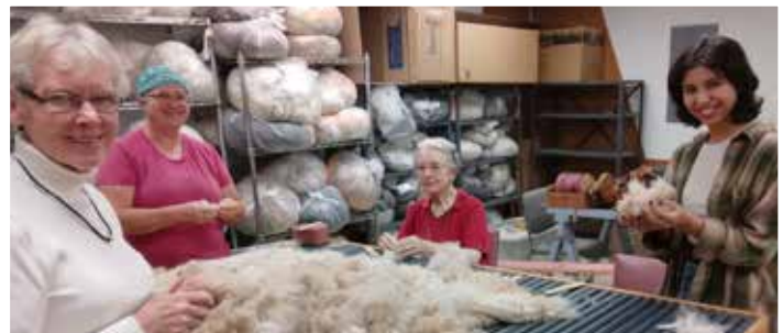
This skirting circle, made up of volunteers, sisters and a White Violet Center for Eco-Justice staff member, sort alpaca fiber while visting each other.