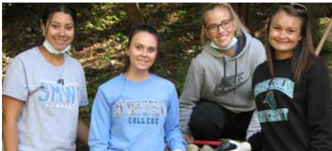
Saint Mary-of-the-Woods College students volunteer with the Sisters of Providence by tidying up shrine areas.

Loving volunteers offered 5,621 hours in 2023 and our sister volunteers offered 33,505 hours, for a total of 39,126 hours. That's over $1.2 million in volunteer hours! Nearly 100 of our sisters regularly volunteer (both on campus and off).